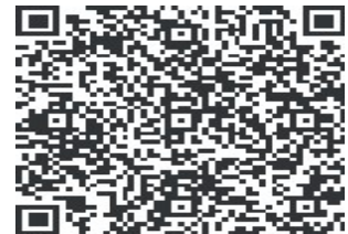
FBC 101 QR Code for registration.

FBC 101 is how friends of FBC Valdosta explore the opportunity to become a member of the church family. Lunch is provided and families are encouraged to attend the class together. Joining the church is not required after attending this event. Please pre-register to help us get a head count for ordering food. Sept.29 @ 11:30 in FLC following both services.